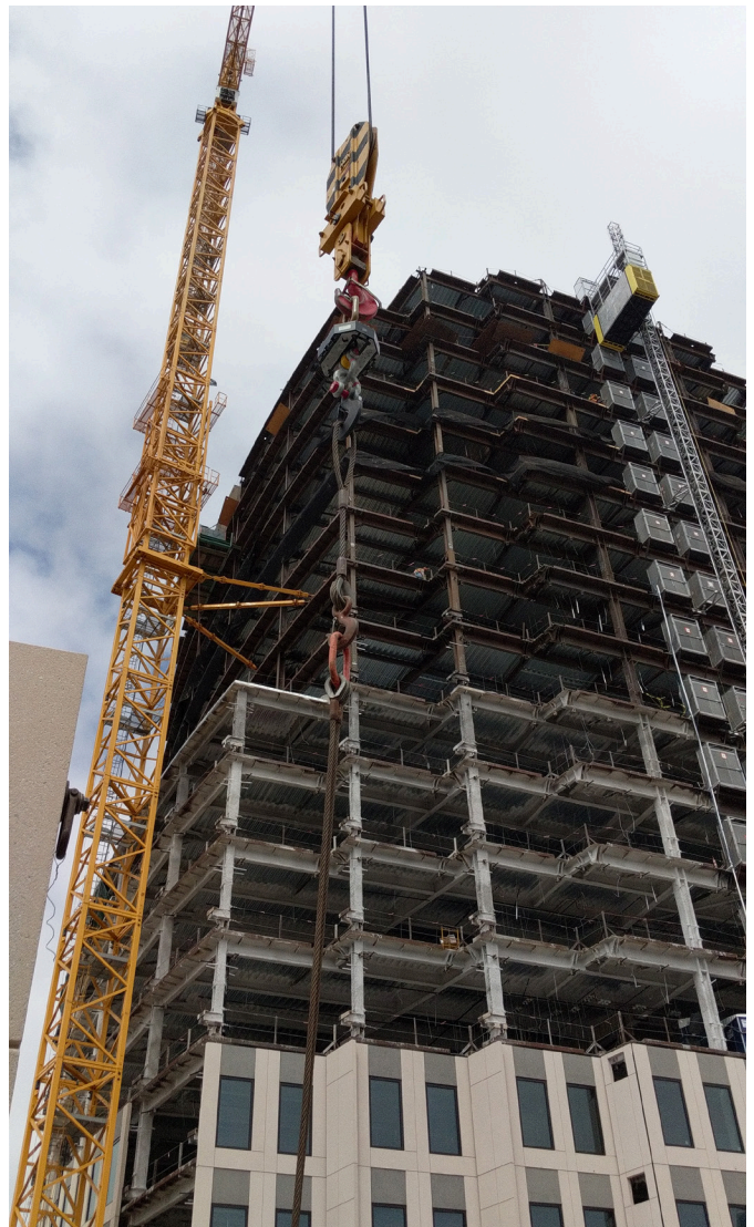
The CraneView™ solution was piloted on the Manchester Pacific Gateway project in San Diego - a 17-story, 378,000 sq. ft. facility with two tower cranes.