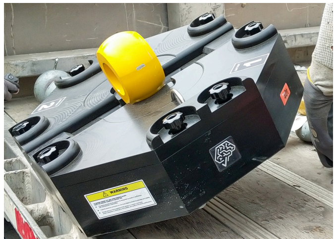
The IoT sensor that captures and analyzes thousands of data points on the flow and handling of site materials.

"In addition to being easy to set-up, CraneView™ connects to our existing workflows and doesn't require additional work from Turner staff to manage," explained Lindsey